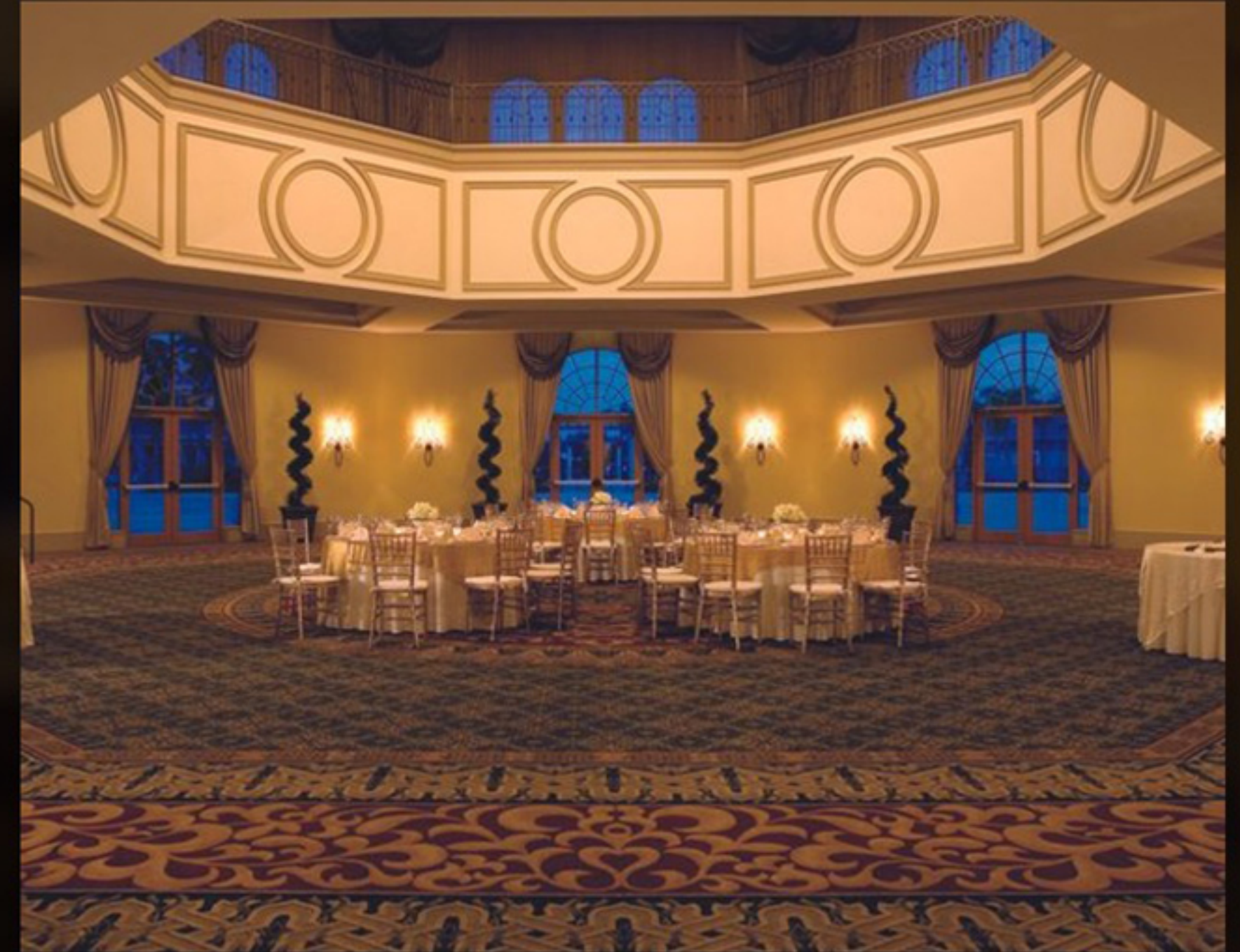
Photo of gorgeous ballroom where Gala will be held.

In a year like no other, we invite you to join us to celebrate the Class of 2021, their journey through OCSA and the legacy they leave behind!